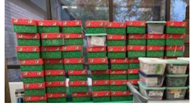
88 Shoeboxes Collected at OSLC