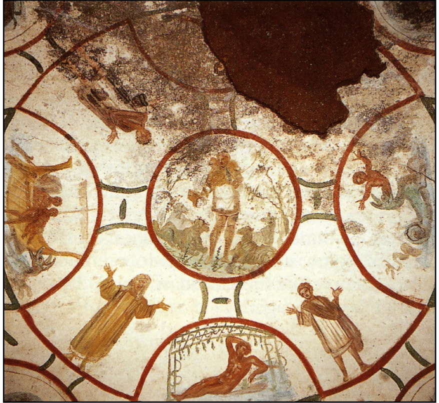
“The Good Shepherd” 3rd century Fresco in the Catacombs of St Callixtus, Rome

FIFTEENTH SUNDAY AFTER PENTECOST (A) SEPTEMBER 10, 2023 • 10:00 A.M.