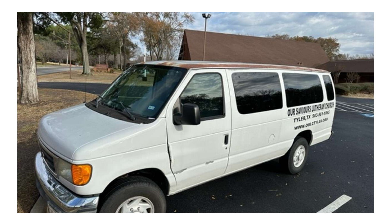
Solicitation of Bids

2006 Ford E-350 van, vin: 1FBSS31L86DA84457 Approximately 67,000 miles, sold as is.