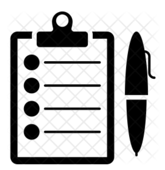
Items for Annual Meeting - Submitted 2 Weeks in Advance

The 2021 Annual congregational meeting will be held on January 24th in the sanctuary immediately following the second service - approximately 11:40 AM. The agenda will include the election of committee members for: Council, Nominating and Audit committees. The meeting will also include a short review of 2020 finances, the 2021 budget and amendments to the NALC Synod constitution. Please try to attend.